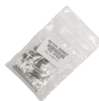
K-66 fastening set